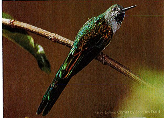
Gray-bellied Comet