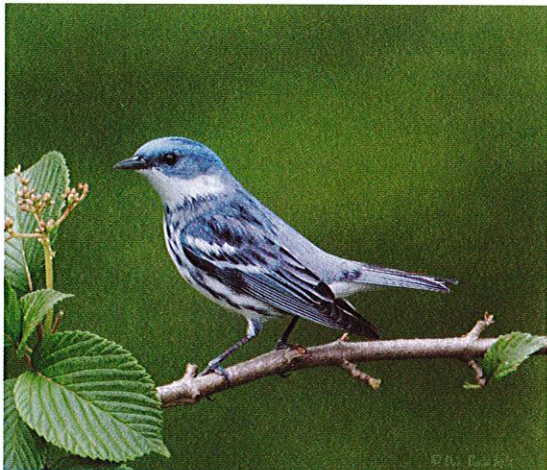
When you donate now, ABC will plant a tree in your name to help birds like the Cerulean Warbler.

Birds that we love, from migratory songbirds like the Wood Thrush to spectacular parrots such as the Blue-throated Macaw, are in jeopardy. Habitats that birds depend on, from forests to wetlands to grasslands, need to be conserved, protected, and restored.