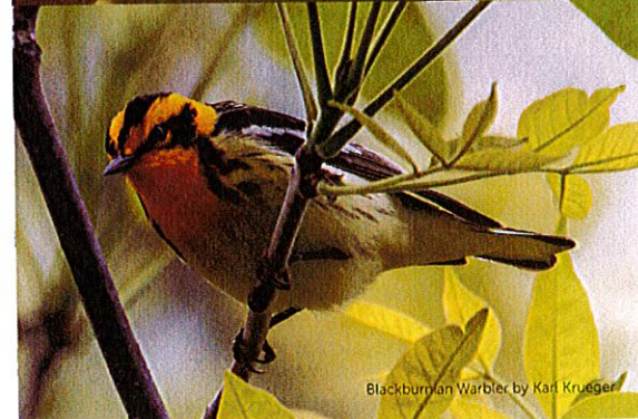
Blackburnian Warbler by Karl Krueger